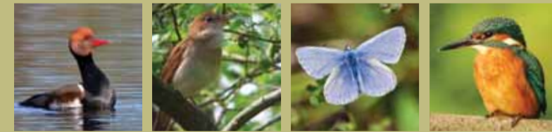
From left to right: Red Crested Pochard, Nightingale, Common Blue Butterfly and Kingfisher.