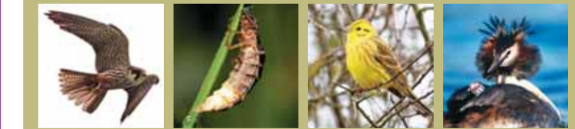
From left to right: Hobby, Glow Worm, Yellowhammer and Great Crested Grebe.

(F) At end of houses after Beverstone Close take bridleway on right (wooden motorcycle barrier). After narrow wooden bridge/400m (G) take immediate left, keep stream on left. Follow grass then gravel track around lake past Whitefriars Sailing Club then tarmac to road.