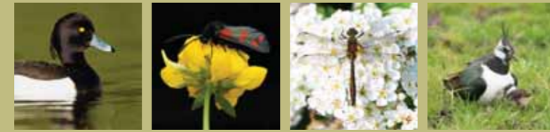
From left to right: Tufted Duck, Burnet Moth, Downy Emerald and Lapwing.

Refreshments: White Hart (Ashton Keynes), Royal Oak (South Cerney) and Bakers' Arms (Somerford Keynes).