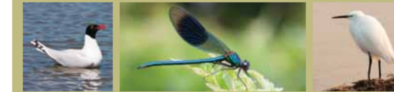
From left to right: Mediterranean Gull, Banded Demoiselle and Little Egret.